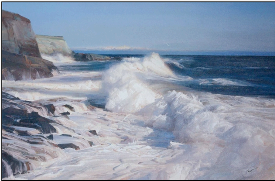
Reaching the Land, Oil on Canvas 24x36"