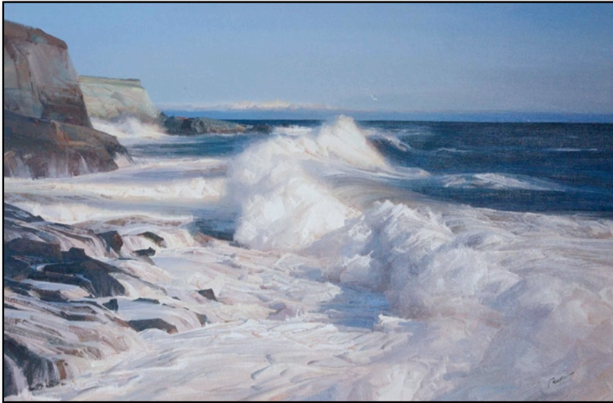
Reaching the Land, Oil on Canvas 24x36"